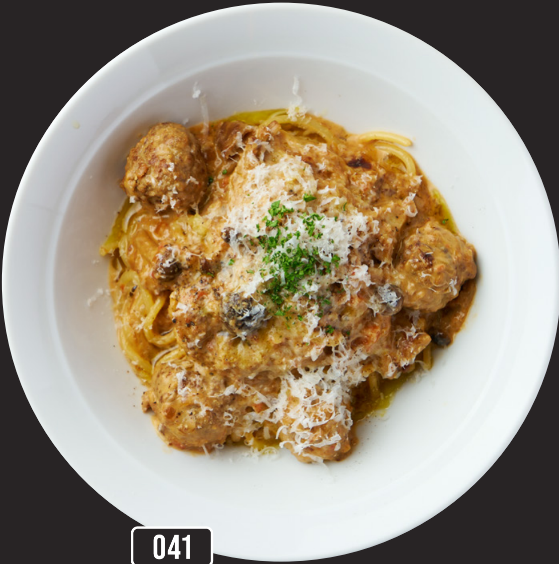
Thick cream meat sauce with Porcini mushroom × 100% Australian grain-fed beef meatballs