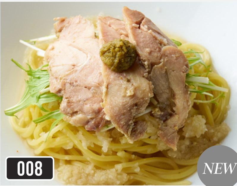
Chicken thigh confit with citrus pepper and grated daikon dashi ¥1,355 +tax (¥1,490)