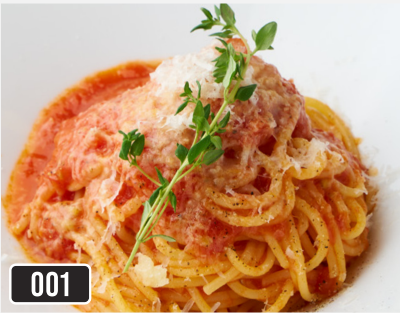
Tomato sauce, fruit tomato and granada cheese ¥1,264 +tax (¥1,390)