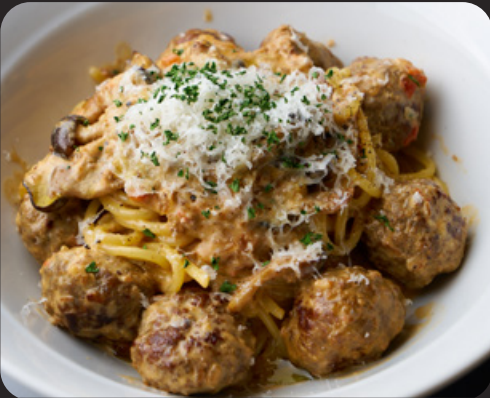
Extra meatballs !

※This photo shows the amount of meatballs is 2 times.