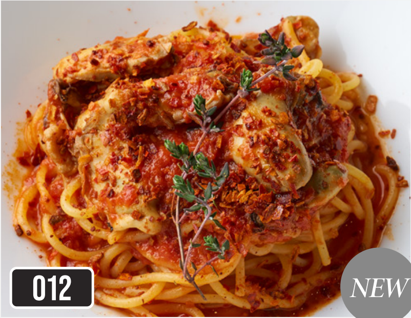
Spicy & crunchy sauce with oysters and ripe tomatoes ¥1,537 +tax (¥1,690)