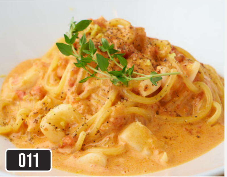
Seafood tomato cream sauce zwai crab and squid ¥1,446 +tax (¥1,590)