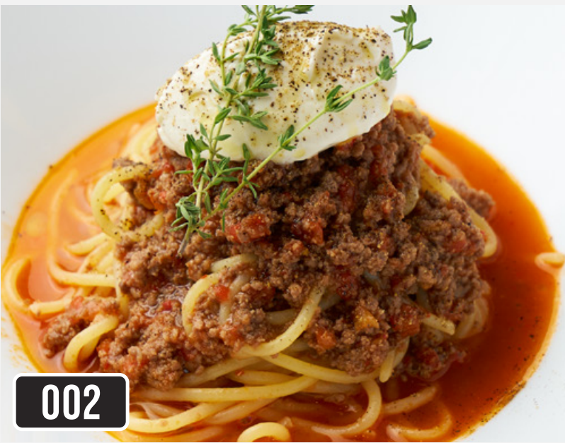
Arrabbiata Australian grain-fed beef ragout ¥1,264 +tax (¥1,390)