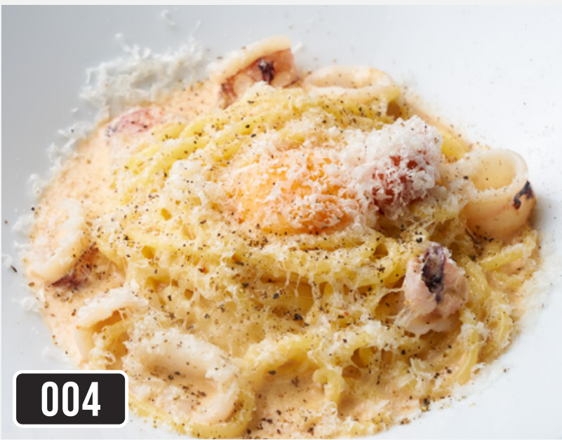
Mentaiko cream carbonara ¥1,264 +tax (¥1,390)