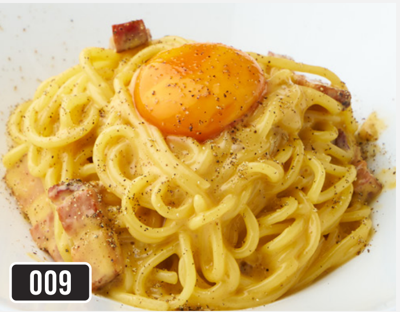
Carbonara, Raw egg from Satsuma and pancetta ¥1,446 +tax (¥1,590)