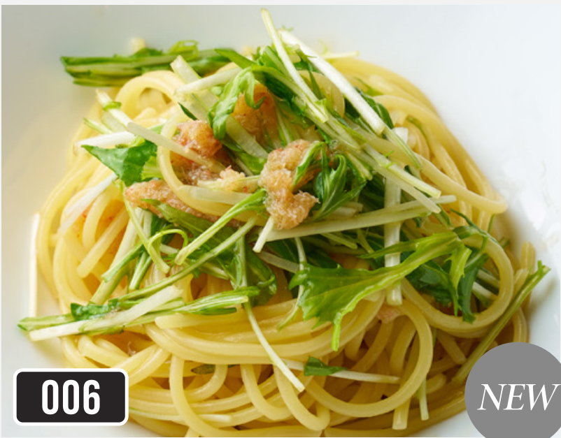
Crab and mizuna with yuzu pepper sauce, served with crab miso dip ¥1,355 +tax (¥1,490)