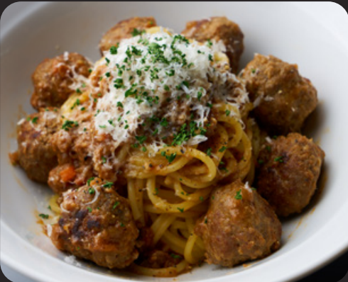
Extra meatballs !

1.5 times (6 pieces) 032 ¥1,719 +tax (¥1,890)