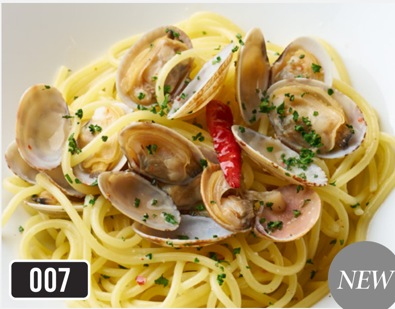
Yuzu-scented clam peperoncino ¥1,355 +tax (¥1,490)