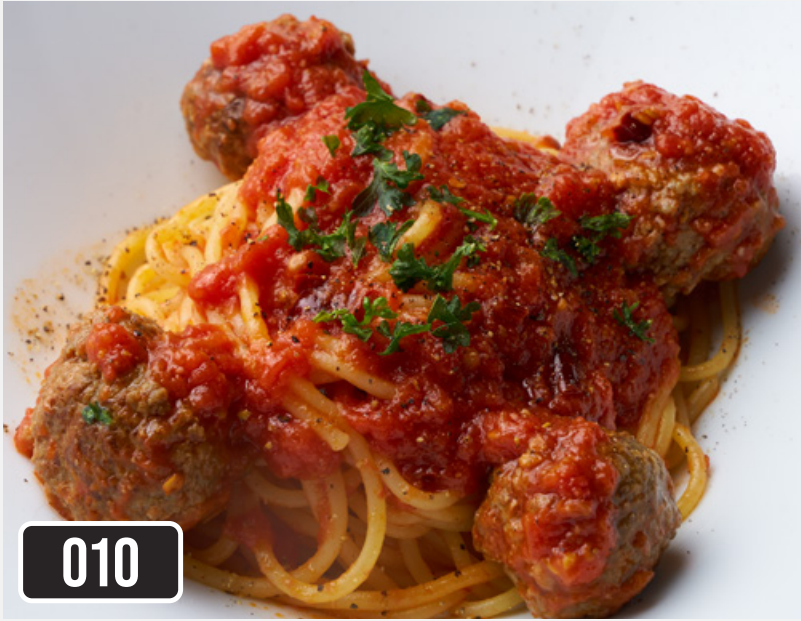
Cagliostro's meatball pasta with spicy tomato sauce and meatballs ¥1,446 +tax (¥1,590)