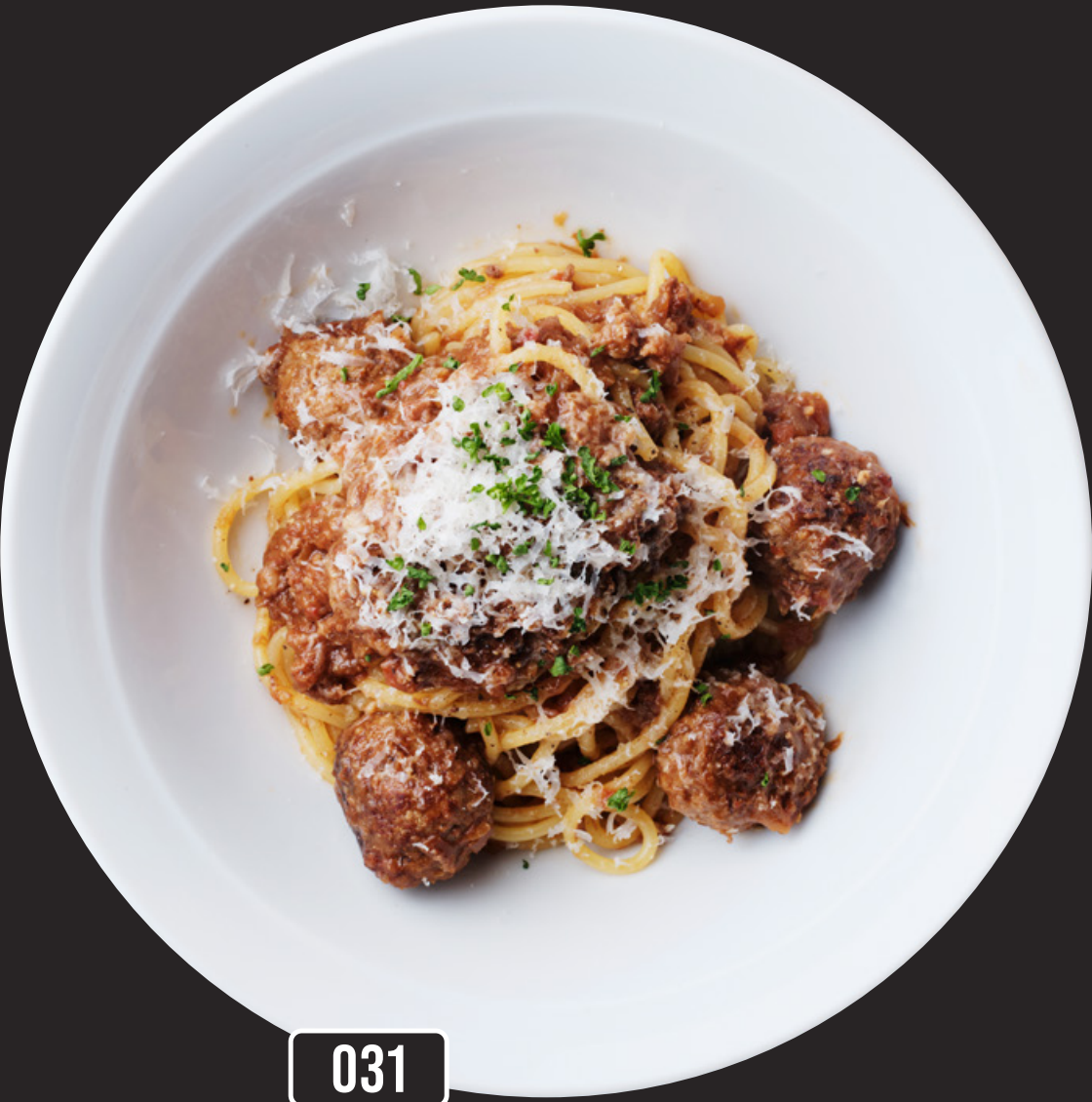
100% Australian grain-fed beef meatballs in meat sauce