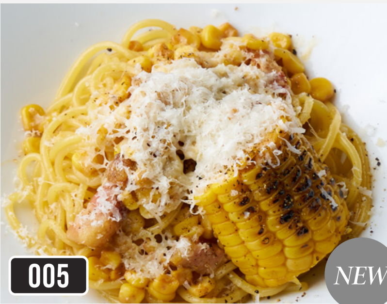
Roasted corn salted butter soy sauce and pancetta ¥1,355 +tax (¥1,490)