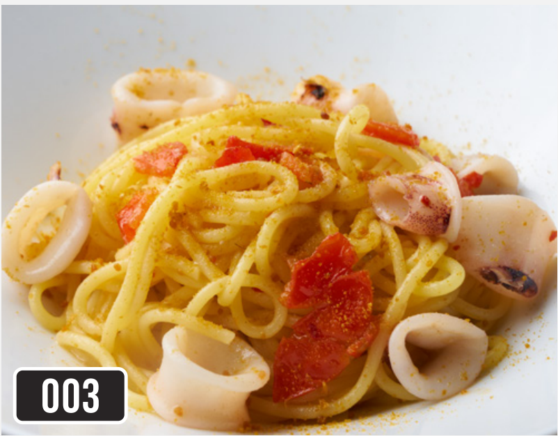
Anchovy tomato sauce with bottarga and spear squid ¥1,264 +tax (¥1,390)